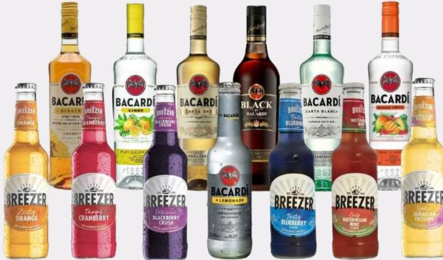
Bacardi Range produced @IGL_Kashipur